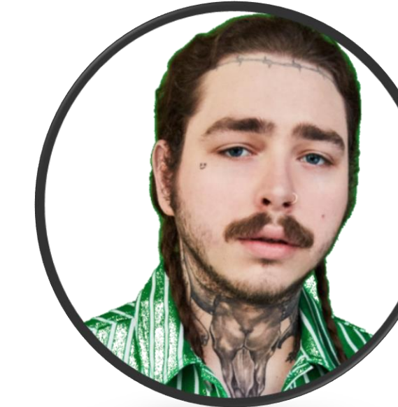
Post Malone @postmalone

She is a former exotic dancer, self-made Instagram personality, and reality-television star, turned into a body-positive female rapper and working mother. Cardi is known for her 'Bronx-girl' antics.