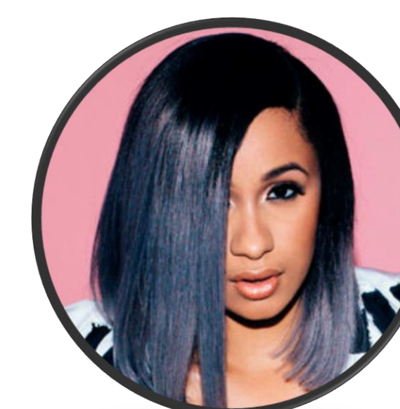
Cardi B @iamcardib

He is a multiracial rapper with several entrepreneurial endeavors outside of music, heavily focused in Canada. His music videos have frequently been the subject of processes of memeification.